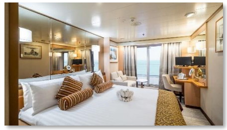
Renaissance key info